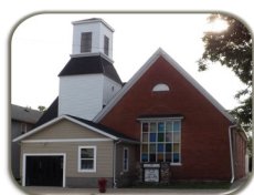
Bancroft Congregational Church 217 S. Shiawassee St. P.O. Box 98 Bancroft, MI 48414