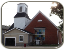
Bancroft Congregational Church 217 S. Shiawassee St. P.O. Box 98 Bancroft, MI 48414

May God bless you far more abundantly than all you can even ask or think Eph 3:20