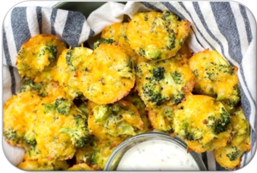
Cheesy Broccoli Bites