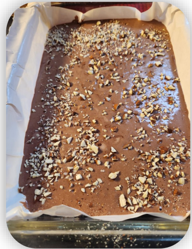
Two Ingredient Fudge

Makes 4 servings Per serving: 1 leaner 1 healthy fat 3 condiments 3 greens