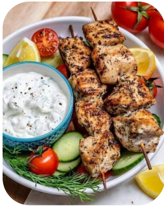
Grilled Chicken Skewers w/Tzatziki 😊