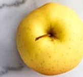
Golden Delicious: Sauces, Cakes, Butter