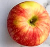
Honey Crisp: Pies, Tarts, Dumplings, Bars