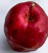
Red Delicious: Sauces, Cakes, Butter