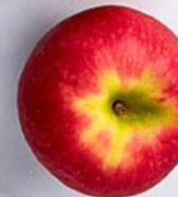
Pink Lady: Pies, Cakes, Breads, Bars