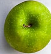
Granny Smith: Pies, Crisps, Tarts