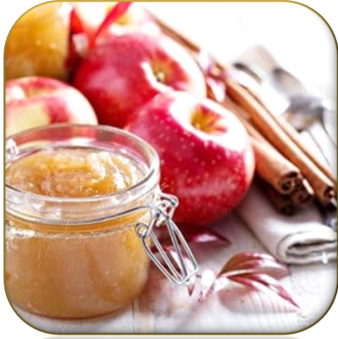
Slow Cooker Apple Butter couldn't be easier.