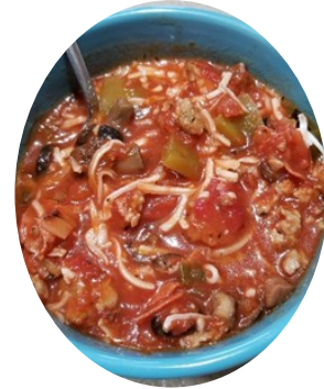
Pizza Soup for a cold winter day!

1 Lean and Green Meal with 3 Condiments and 1 Healthy Fat