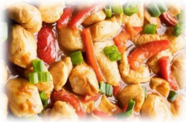
Chinese Orange Chicken (One Serving)

9 oz raw chicken breasts, cubed - should yield 6 oz cooked (1 Lean) 1/4 cup chicken broth (1/4 Condiment) 1 1/2 cups diet orange soda with 0 carbs such as diet Crush or diet Rite Tangerine Soda (I used only 1 cup) 1/2 tsp Chinese Five Spice Blend (2 Condiments) 1/2 cup green and red peppers, sliced (1 Green) 1 tsp olive oil (1 Healthy Fat) 1 clove garlic, minced (1 Condiment) 1 cup grated, cooked cauliflower (2 Greens) Red pepper flakes (optional)