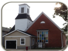
Bancroft Congregational Church 217 S. Shiawassee St. P.O. Box 98 Bancroft, MI 48414