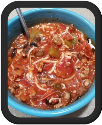
Pizza Soup for a cold winter day!